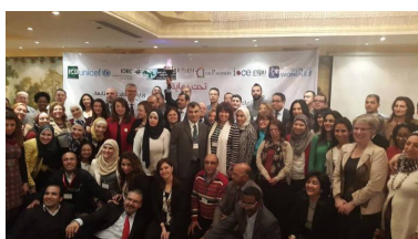
Lighting of Evaluation Torch during the 4th International Conference of MENA (Middle East and North Africa) Evaluation Network Conference, Egypt