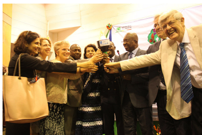
Minister Antonin Dossou & Prof. Leonard Wantchekon participate in the lighting of the 2015 Evaluation Torch during the Regional Conference on Public Policy Evaluation, Benin