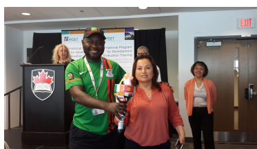
Evaluation Torch lighting during the IPDET Conference, Canada