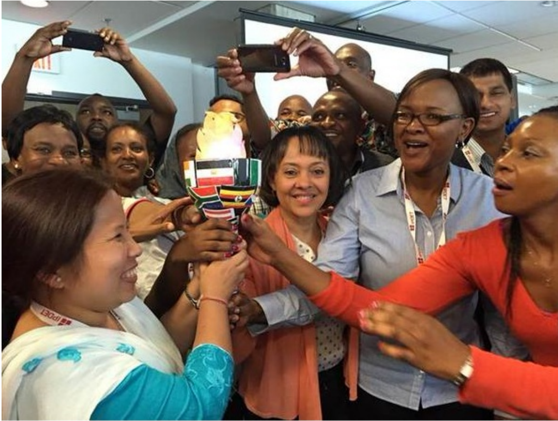
37th lighting of the Eva ITorch @IPDET conference for 2015 Eval Year.