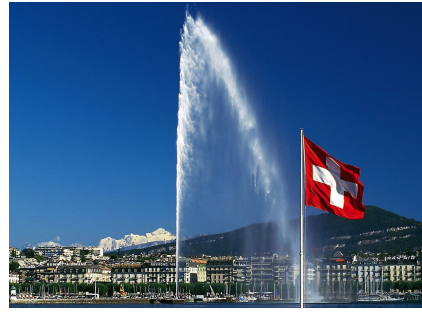
UNEG Evaluation Week 2016 will be hosted in Geneva, Switzerland, from 25-29 April, 2016

2016 will be a crucial year that will see several major processes coming to a new start. With the adoption of the UN General Assembly Resolution on evaluation capacity building, the celebration of the 2015 International Year of Evaluation and the launch of the Sustainable Development Goals (SDGs) in 2015, UNEG has a significant opportunity to continue to bring evaluation to the forefront of development work. The SDGs in particular will shape the sustainable and equitable development discourse and action for the next 15 years. To remain relevant and fit for purpose, UNEG will need to strategically position itself as a key player in the global development community, while continuing to strengthen capabilities of UN evaluation functions. The UNEG Chair, Secretariat and the Geneva-based UNEG members have met several times and discussed the preparation and organization of the 2016 Evaluation Week, which will take place from 25 to 29 April 2016 in Geneva. The theme of the Evaluation Week will be finalized soon and four organizational committees of different events will be established.