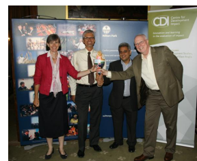
Evaluation Torch at Centre for Development Impact Conference, United Kingdom