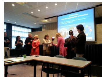
Eval Torch lighting during the start of M&E Conference for Responsible Innovation, New Zealand