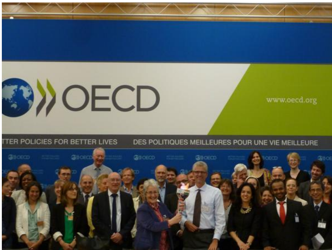
Lighting of the Eval Torch @ the 18th OECD-DAC Network on Development Evaluation Meeting, Paris France

Indran Naidoo, Director of the UNDP Independent Evaluation Office and UNEG Vice Chair for Strategic Objective One also provided a status report on the ongoing collaboration between UNEG and DAC Evalnet on peer reviews of evaluation functions. In 2014, UNEG completed three peer review including those of the Office of Evaluation of the World Food Programme (WFP); Independent Evaluation Office of Global Environment Facility (GEF); and Evaluation Office of United Nations Entity for Gender Equality and the Empowerment of Women (UN-Women). Peer Review reports are available at: