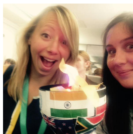
2015 Evaluation Torch lighting at DFID meeting, United Kingdom