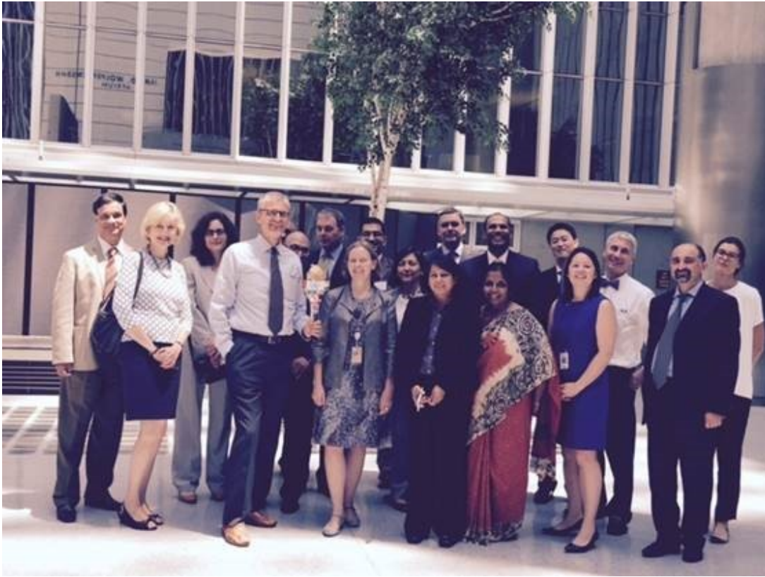
ECG members light EvalTorch @ World Bank's Independent Evaluation Group HQ, Washington DC