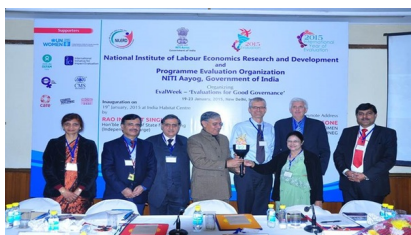
On Jan 19, EvalWeek India became 1st country to receive the Evaluation Torch in 2015